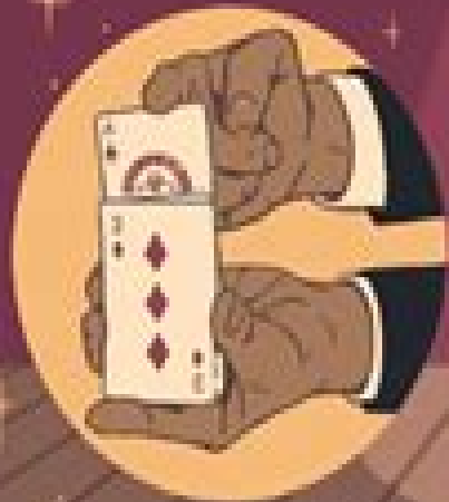
The Rising Card