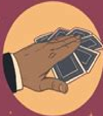
The Magnetic Hand