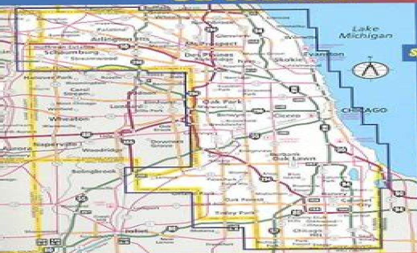
StreetFinder Coverage Area