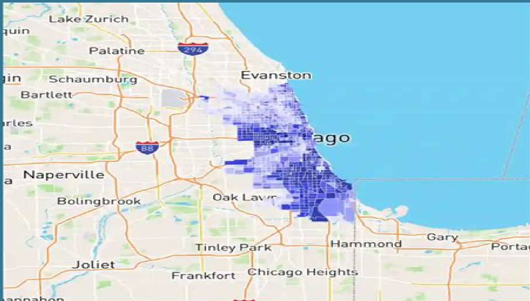
Chicago, IL Crime Map By Neighborhood

(click to see interactive crime map and report)