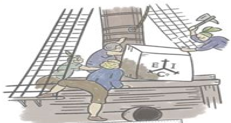
The Boston Tea Party

The Boston Tea Party, a defiant act by brave patriots, boldly threatened their unswerving pursuit of freedom and self-government. By discarding tea into the sea, they fearlessly asserted their rights and declared their determination to shape the course of their own nation.