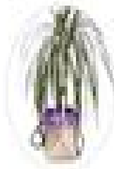
Candles & Holders