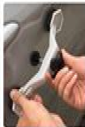
Easy DIY Dent Removal Repair Tool Kit