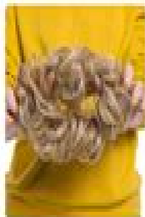
Rose Bun Hair Scrunchie