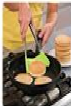
Flip Turn & Grab Spatula