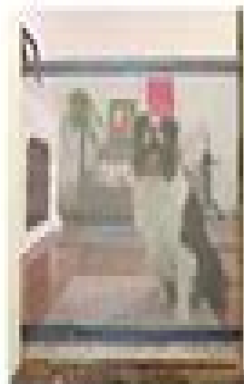
Dog Safety Gate