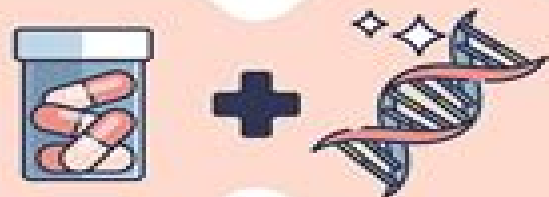
DRUG - GENE INTERACTION