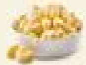
Macaroni & Cheese