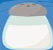
咸 xián Salty