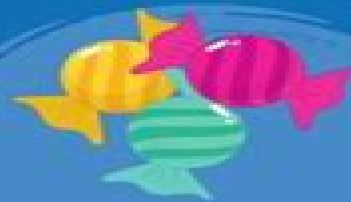
甜 tián Sweet