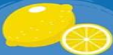
酸 suān Sour