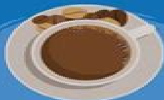
苦 kǔ Bitter