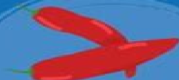
辣 là Spicy