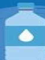
淡 dàn Bland