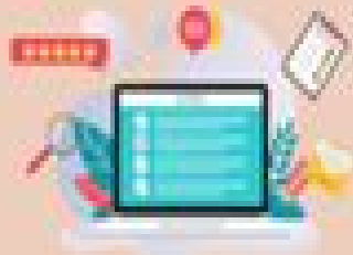
Fill Online Surveys