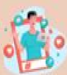
Become an Influencer