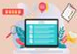
Fill Online Surveys