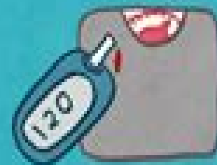
Diabetes and obesity