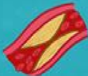
Coronary artery disease