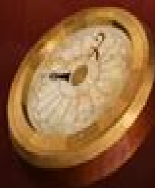
Compass of Fate