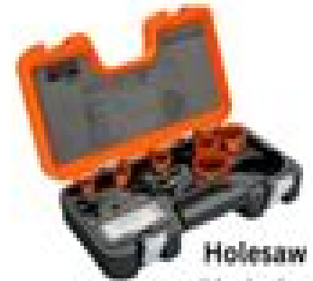
Holesaw Blade Set