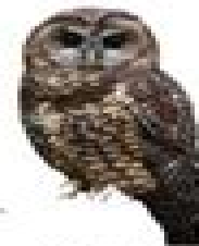
Northern Spotted Owl