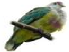
Cook Islands Fruit Dove