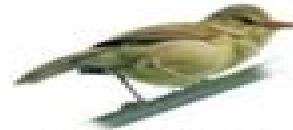
Cook Islands Reed Warbler