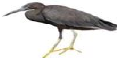
Pacific Reef Heron