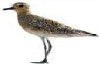
Pacific Golden Plover