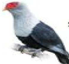
Seychelles Blue Pigeon