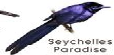
Seychelles Paradise Flycatcher