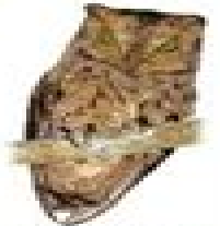
Seychelles Scops Owl