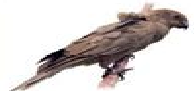
Seychelles Black Parrot