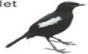
Seychelles Magpie Robin