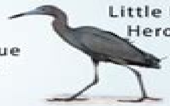
Little Blue Heron