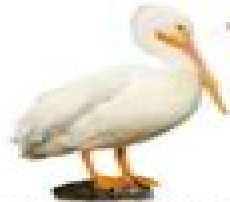
American White Pelican