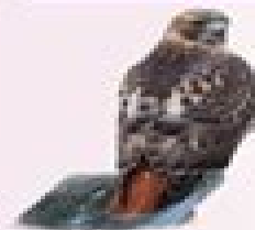
Red- Tailed Hawk