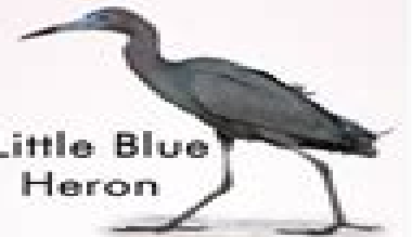
Little Blue Heron