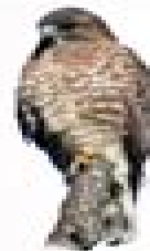
Broad- winged Hawk