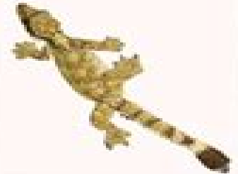
Kuhl's Parachute Gecko