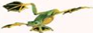
Wallace's Flying Frog