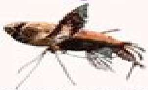
Freshwater Butterfly Fish