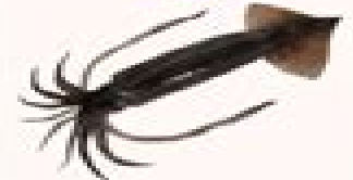
Japanese Flying Squid