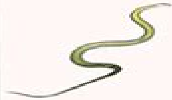
Paradise Tree Snake