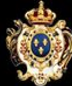
Henry I Reigned 1031 - 1060