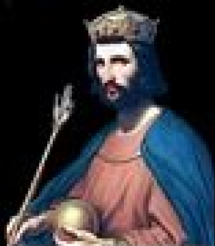
Founder, 1st King