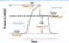
Flow-Volume Loop This graph illustrates the relationship between flow and volume during a breath. The x-axis represents volume, and the y-axis represents flow. The inspiratory phase shows a positive flow curve, and the expiratory phase shows a negative flow curve. The total volume change is the tidal volume.