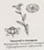
Small text caption below the logo.