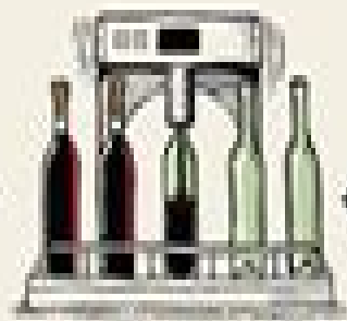
Bottling & Labelling