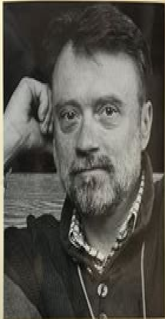
John Crowley is the author of the best-selling novel Earth , and is twice winner of the World Fantasy Award. He lives with his wife and daughter in a "Carpenter's Gothic" house on the wrong side of the Hudson River in Manhattan.