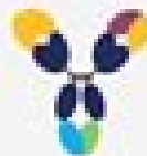
KIH-IgG (common LC)