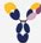
K \lambda -body (common Fc)