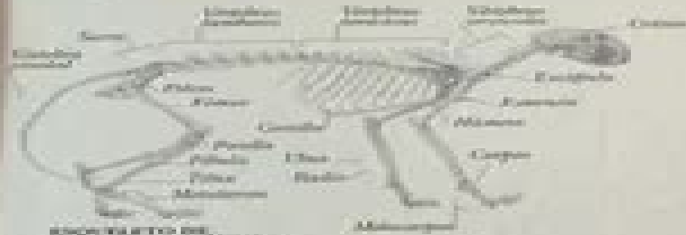
ESQUELETO DE CERDO DOMESTICO