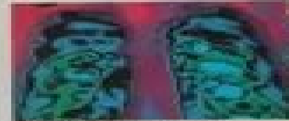
TERMOGRAFÍA DEL TORAX