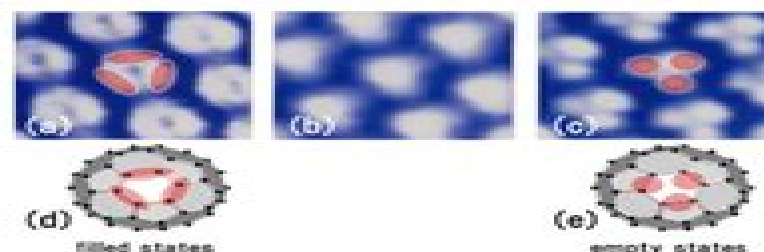
Figure 1: STM images of C_{60} molecules in a Cu(111)-4\times 4-C_{60} monolayer phase with sample bias voltages of (a) -2.0 V, (b) -0.10 V, and (c) 2.0 V [5]. (d, e) Ball-and-stick models of a C_{60} molecule. Marked areas in (a, d) and (c, e) correspond to filled ( \pi ) and empty ( \pi^* ) electronic density states of C=C double bonds, respectively.

Initially, STM images of the fullerene molecules appeared to show uniform electronic states, and striated internal structure was also observed [4]. However, the highly symmetrical internal structure of C_{60} was observed in Cu(111)-4\times 4-C_{60} monolayer phases at room temperature, and it was reported [5] that this internal structure mapped the electronic state of C_{60} molecules, combining first-principle calculations and STM (Figure 1). This report was the first to confirm that the