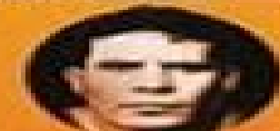
JULIO CESAR CHAVEZ