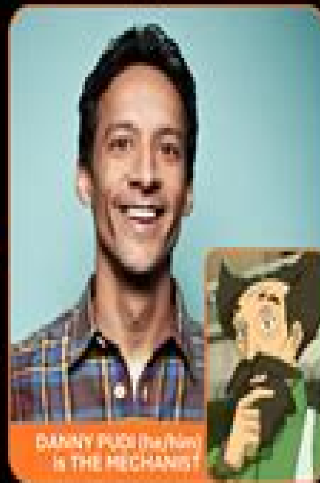
DANNY PUDI (he/him) is THE MECHANIST