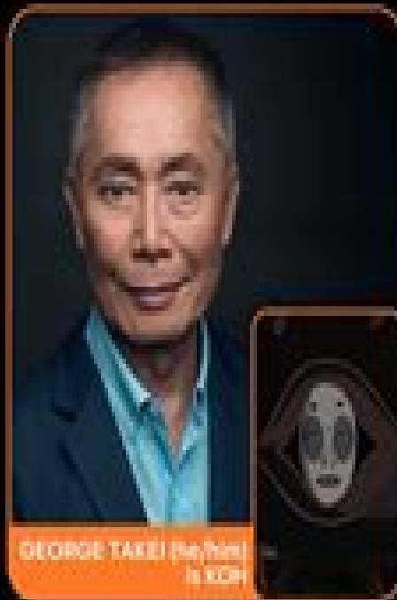
GEORGE TAKEI (he/him) is KORI