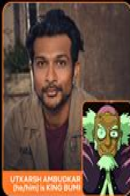
UTKARSH AMBUDKAR (he/him) is KING BUMI