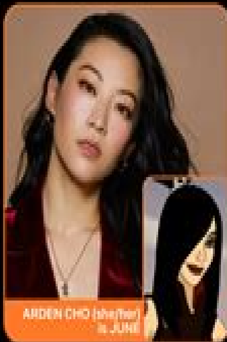
ARDEN CHO (she/her) is JUNE