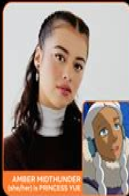
AMBER MIDTHUNDER (she/her) is PRINCESS YUI