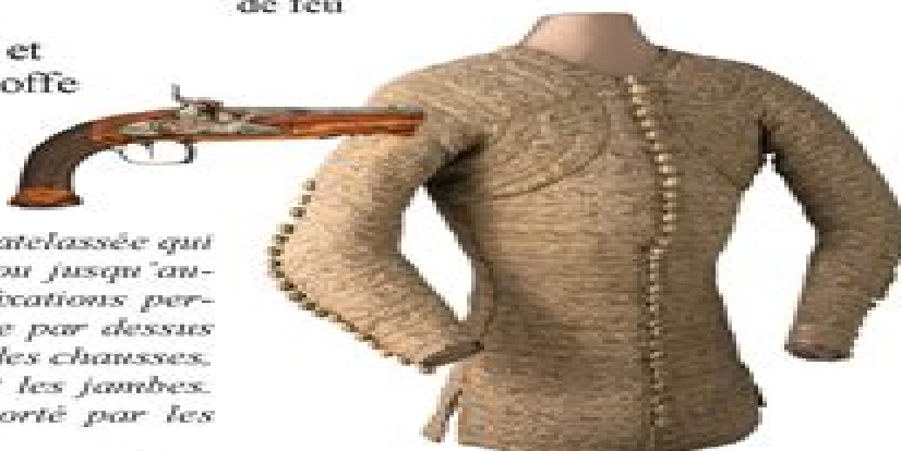
Pourpoint de Charles de Blois

... il n'y a rien d'impoli comme de venir ainsi à brûle-pourpoint parler de choses sérieuses à un pauvre homme de soixante-cinq ans, ... Stendhal, Lucien Leuwen, t. 1, 1836, p. 28.