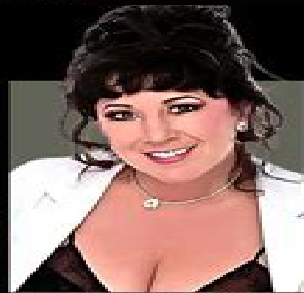
ANNIE SPRINKLE 1962