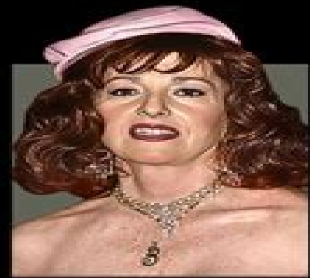
EDY WILLIAMS 1973