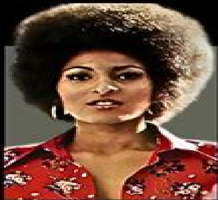
PAM GRIER 1973