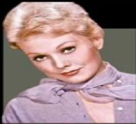
KIM NOVAK 1964