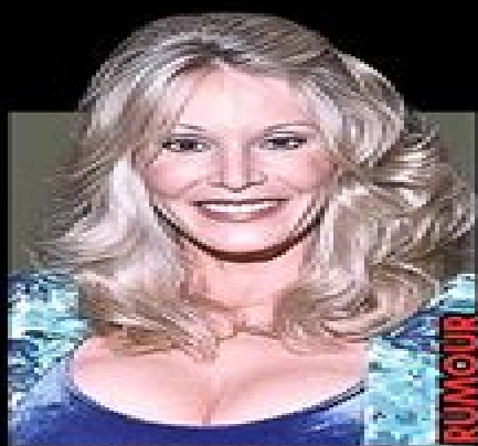
JUNE WILKINSON 1961