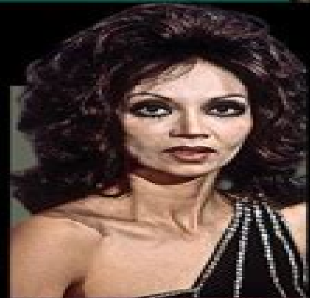
CHELO ALONSO 1960