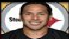
TROY POLAMALU II