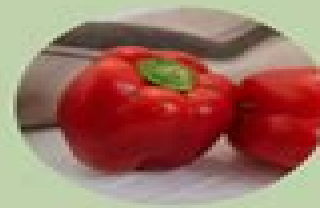
Red bell peppers