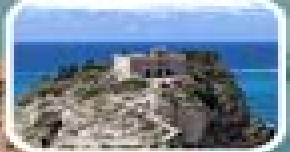
Coast of The Gods