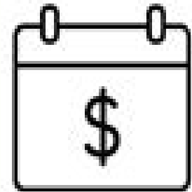
Recurring Deposit Account (RD)