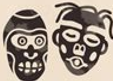
Wild Man & Woman of the Woods