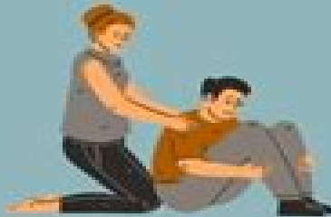
Sensitive to others' emotions