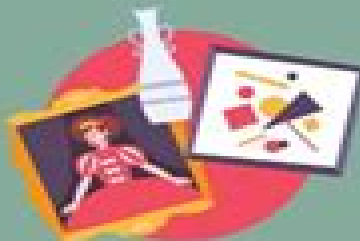
Deep appreciation of beauty