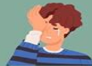
Strong emotional responses