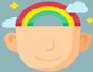
A vivid imagination