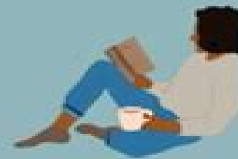
Need time alone