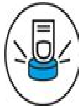
Interactivity and Agency