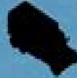
COMBAT LOGISTICS BATTALION

APPROX 2000 PERSONNEL A graphic showing 2000 human silhouettes of varying heights, arranged in a line to represent the total personnel count.