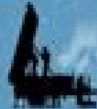
LITTORAL ANTI-AIR BATTALION