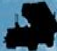
LITTORAL COMBAT TEAM