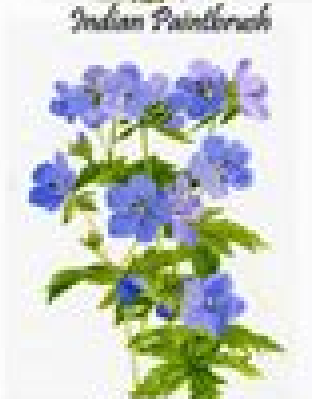
Cranesbill (Wild Geranium)