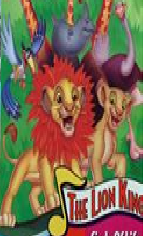
THE LION KING