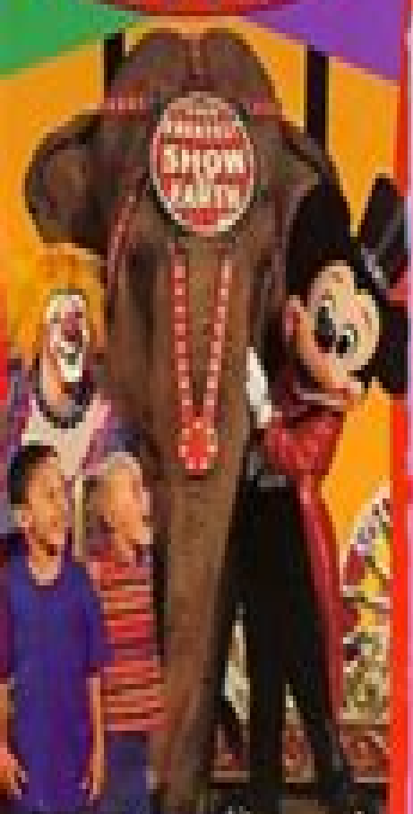
Let's Go To The Carnival