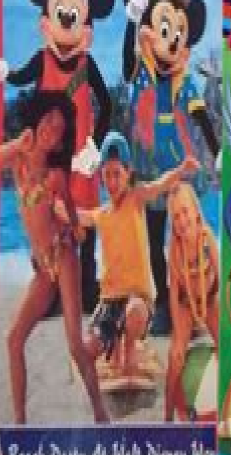
Beach Party At Walt Disney World