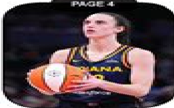
Caitlin Clark Acknowledges Her White Privilege, Apologizes For Black Women in WNBA