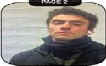
Suspect in Killing of Health Care CEO Faces 5 Charges