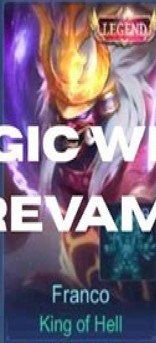
Franco King of Hell