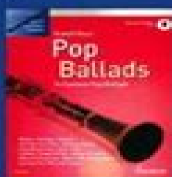
Pop Ballads, 118 (14400) ISBN 978-3-7083-1723-6