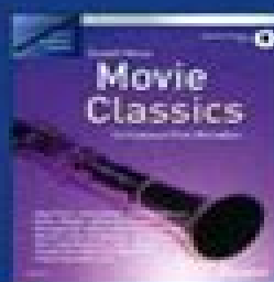
Movie Classics, 119 (14400) ISBN 978-3-7083-1724-3