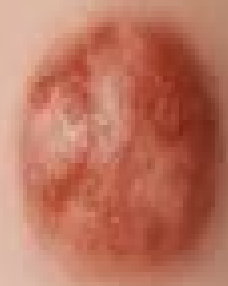
Diameter over 6mm