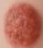
Evolution over time.