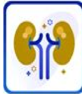
Chronic kidney disease