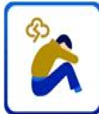
Mental health disorders