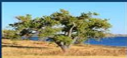
7. EASTERN COTTONWOOD