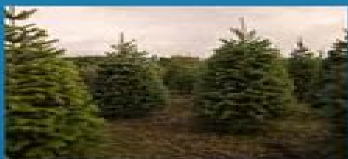
1. DOUGLAS FIR