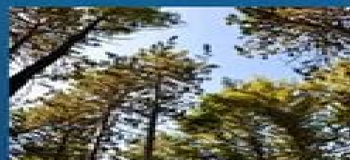
6. RED PINE