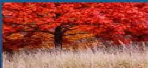
4. NORTHERN RED OAK