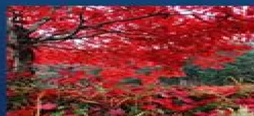
9. RED MAPLE