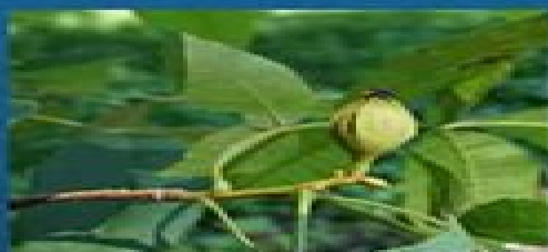
5. BITTERNUT HICKORY