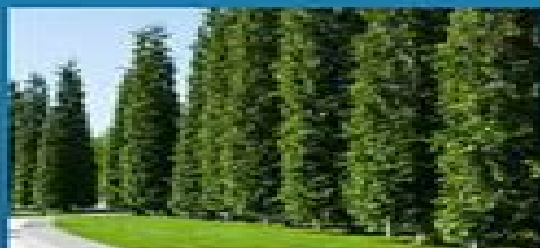
2. WESTERN REDCEDAR