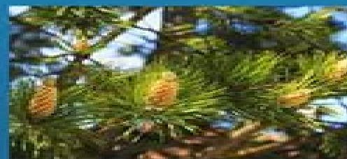
3. EASTERN WHITE PINE