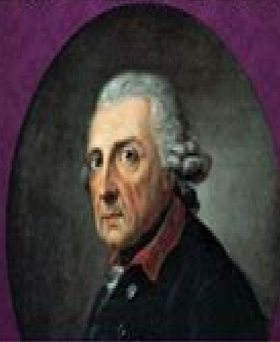
Frederick II (Prussia)