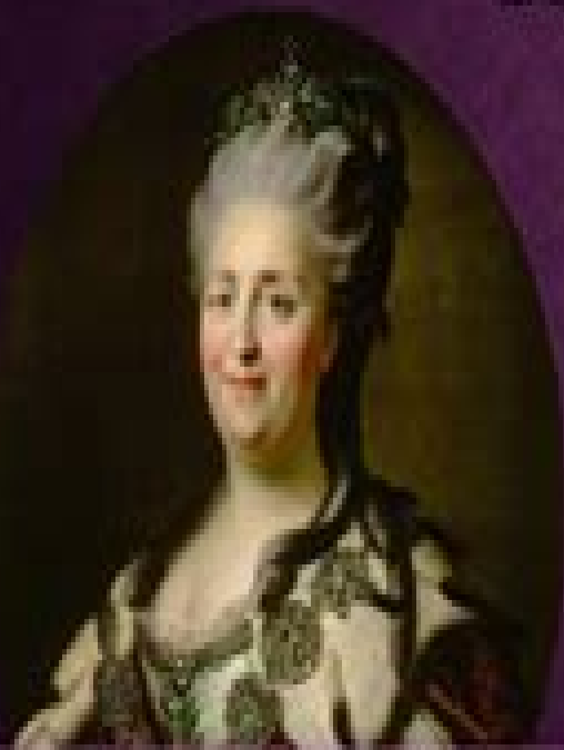
Catherine II (Russia)