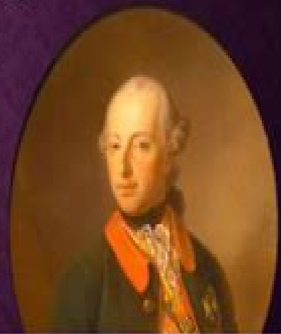
Joseph II (Austria)