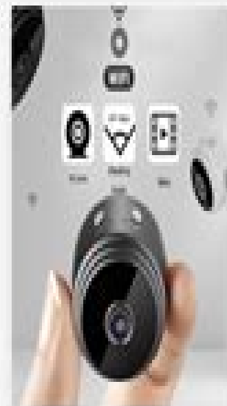
WiFi HD 1080P Mini Camera