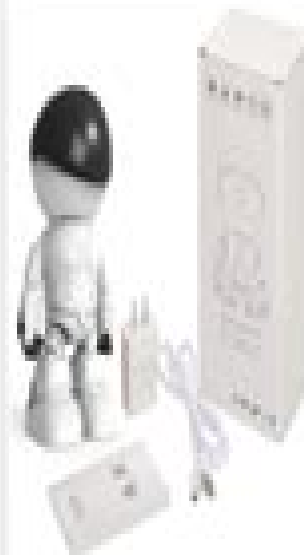
352° Robot Security WiFi Camera