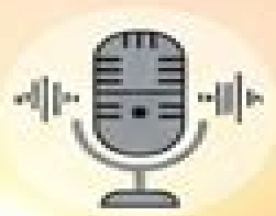
AI Property management