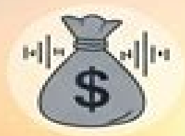
AI content creation